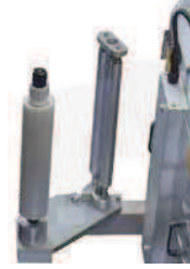
Bottom web feed with rigid or flexible bottom web with fast film change. A brilliant space saver.