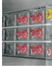
Loading zone Products are loaded into formed pockets