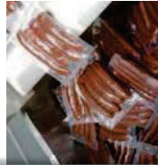
Cutting station Packages are separated Film trim is automatically removed