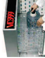
Top web infeed from above (integrated brake system)