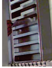
Forming station Rigid or flexible bottom web is heated and formed into pockets