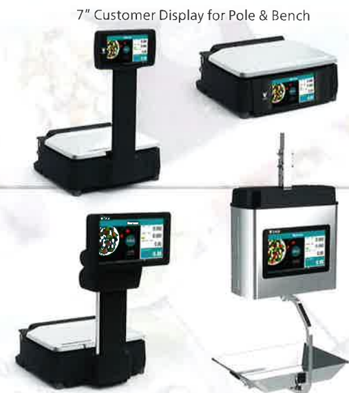
7" Customer Display for Pole & Bench