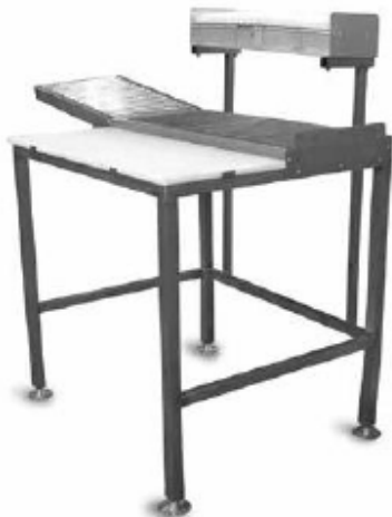
Pictured with 2ft infeed and POP label dispenser